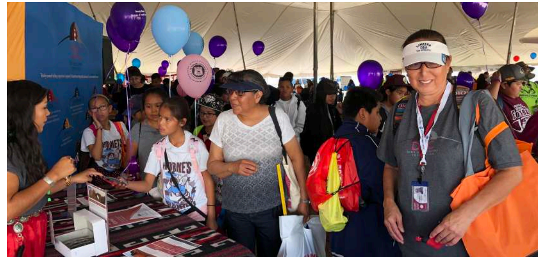
DDC delegation meet with Shareholders from across the Navajo Nation at the fair Youth and Elder Day.