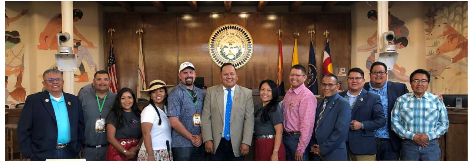
DDC and subsidiary staff meet with Navajo Nation Speaker and Council Delegates on the Council Chambers floor.