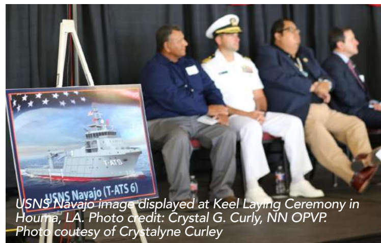
USNS Navajo image displayed at Keel Laying Ceremony in Houma, LA.