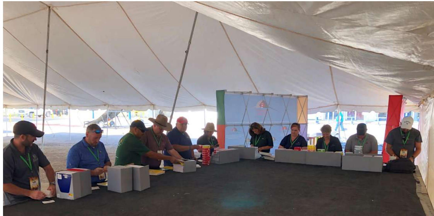
DDC Team prepares promotional items for the Navajo Nation fair booth and parade