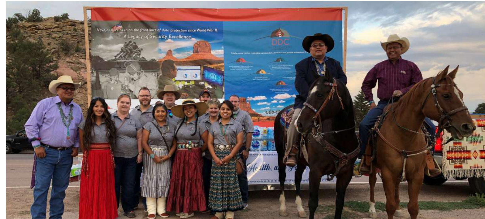
DDC team with Shareholder Representatives in front of Navajo Nation Fair parade float

October begins the time of year when leaves change color, insects retreat, and warm air cools. The Navajo people call this time, "aak'ei," which is fall or autumn. Fall is represented by the Navajo word for "October," Gháájí, that translates into "half" or "back to back," which signifies the meeting of the summer and winter seasons. The Navajo people recognize this "separation of the seasons" when the harvests have been reaped for sharing and preparations are made for the approaching winter season. Many community celebrations take place to replicate the past times of exchange of goods from across the reservation. The atmosphere is filled with appreciation for the harvests and seeds for next year's crops, as well as the end of a successful growth cycle for plant and animal life. It is a time for the natural world to rest and recover for the upcoming year, as we embark on November, "Níłch'í ts'ósí." Mother Earth's preparation for next year signifies the beginning of the Navajo New Year. Happy Navajo New Year to you and yours as we give thanks for you and your contributions to the ecosystems of your world!