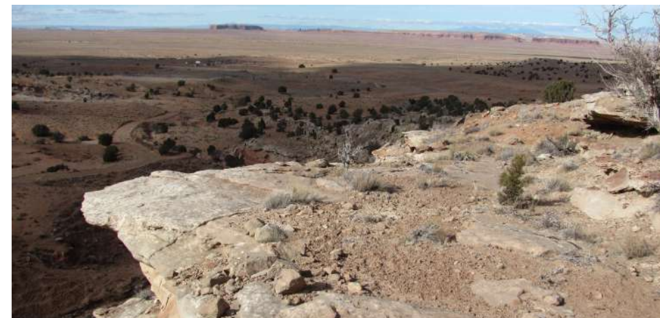
Beclabito, NM, Navajo Nation.

BRIC received the Bureau of Indian Affairs (BIA) Ft. Wingate Historical Assessment contract to perform historical assessments and on-site archaeological support services on the Wingate Elementary School campus on the Navajo Nation. BRIC also prepares to create a film to document the history of the school campus. The school is located in the small settlement of Fort Wingate, NM, east of the former Fort Wingate Army Depot. The BIA proposes to demolish unsafe buildings within a 15-acre range of the school site complex, which is comprised of 42 vacant buildings.