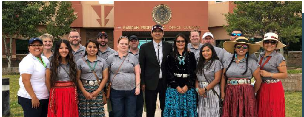
DDC and family of subsidiaries meet with Navajo Nation President, Jonathan Nez, during Navajo Nation Fair.