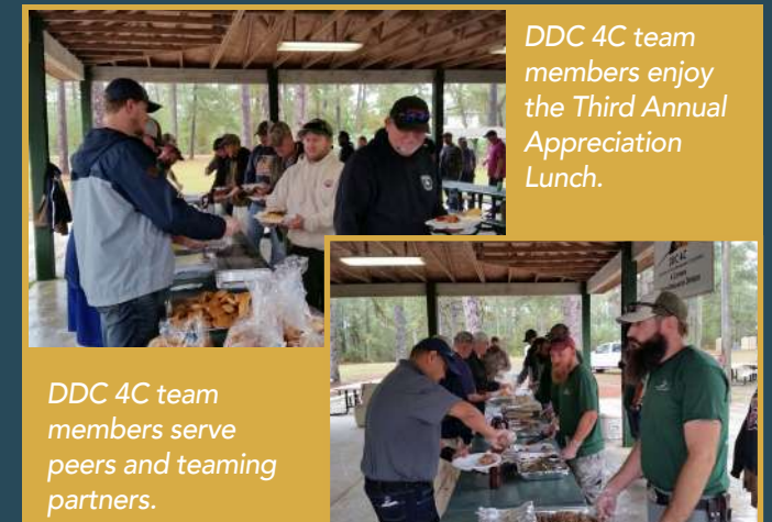
DDC 4C team members enjoy the Third Annual Appreciation Lunch.

DDC 4C hosted its third annual appreciation lunch for the natural resources teams, customers, vendors, and partners at McKellars Lodge in Fort Bragg, NC. Attendees included the DPW Environmental Division, Forestry Branch, Endangered Species Branch, Environmental Compliance Branch, and DPT Range Control Office. Vendors, including Bell's Seed Store and Gregory Poole Equipment, and teaming partner, Jay Carter & Associates also attended the event. We extend our sincere appreciation to all of our employees and partners that support our efforts to provide excellent natural resources services.