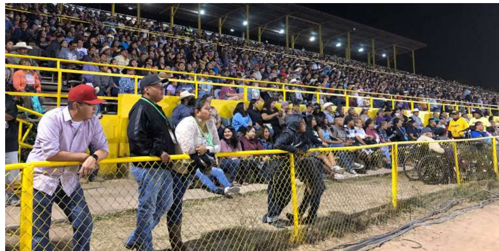
More than 15,000 Navajo constituents attended the Navajo Nation rodeo and concert

If you know an active job seeker that meets the qualifications for any of our current openings, please submit the candidate directly to recruiting@ddc-dine.com with a comment that you are an existing employee and referring the candidate. You can also tell the candidate to apply through the DDC Careers web-page at www.ddc-dine.com .